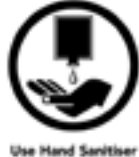
Use Hand Sanitiser

(Use wipes provided and ensure your hands are dry from the sanitiser before lighting candles)