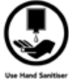
Use Hand Sanitiser

(Use wipes provided and ensure your hands are dry from the sanitiser before lighting candles)